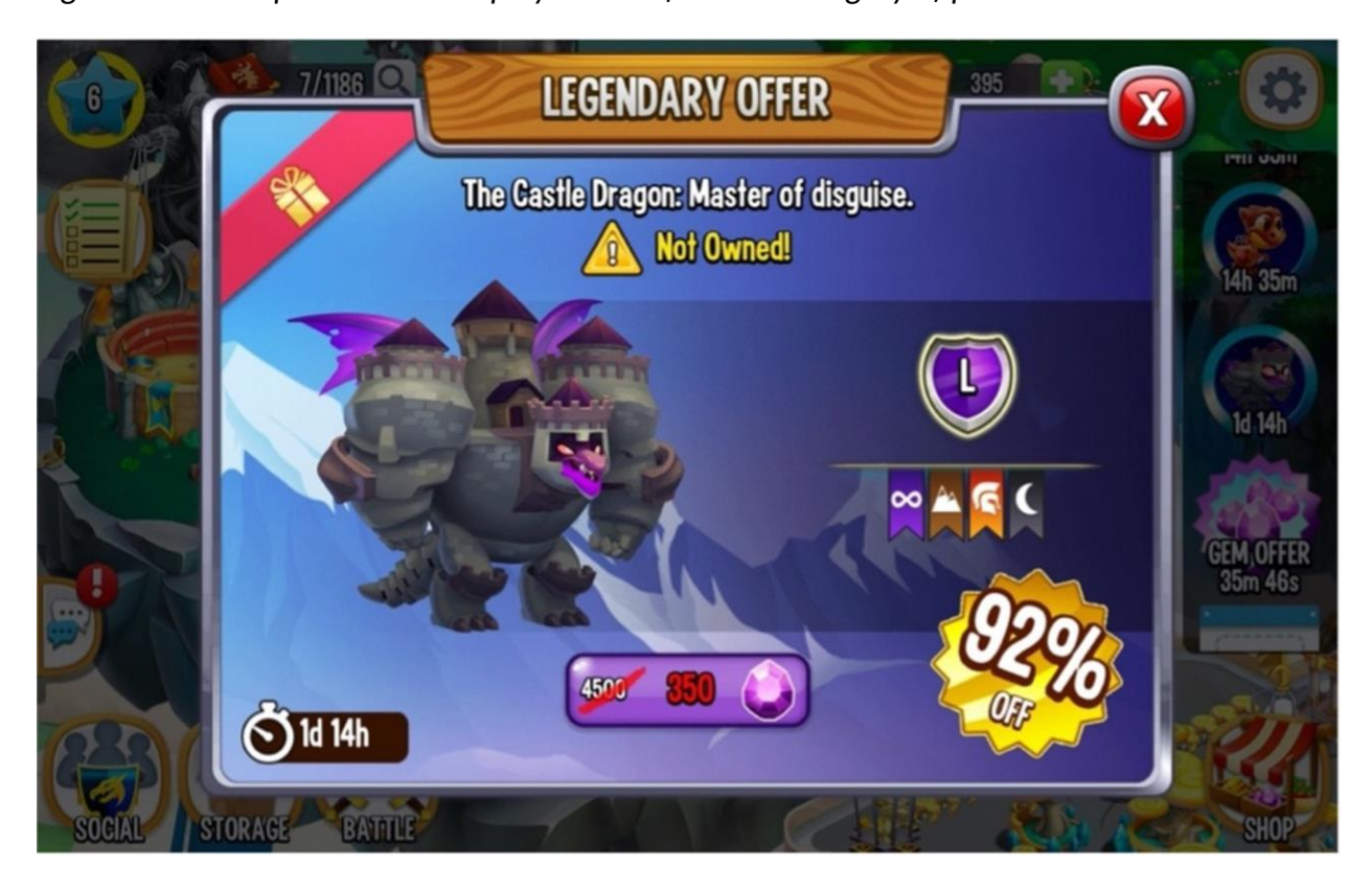
Figure 2. A purchase screen for a dragon in Dragon City prominently displays a timer.