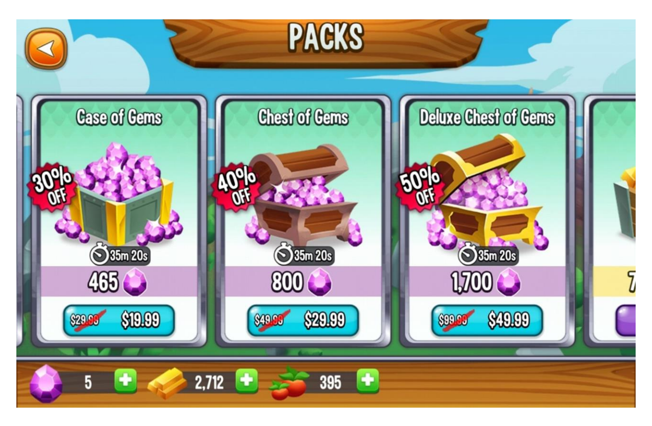
Figure 4. Dragon City's Gems are similarly discounted in bulk, and also display prominent sale countdown timers to encourage impulse purchases.

Some may argue that children cannot make purchases without a parent's knowledge and permission. But as some researchers have pointed out, payment for many in-game purchases is "executed through an account at the mobile application store. As the payment instrument is already linked to an account, children can pay by themselves." As a result, children often make purchases without their parents' knowledge, sometimes even leading to instances where children have unwittingly spent thousands of dollars, and to the chagrin of their parents.