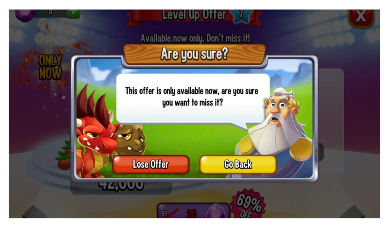
Figure 6. In Dragon City, this screen appears when a player attempts to decline a sudden "Level Up Offer." Distressed cartoon dragons appear near the red "Lose Offer" button which a player must touch to avoid the transaction.

easier to play,<sup>46</sup> and Dragon City presented images of crying dragons when a player attempted to decline a sudden purchase offer.