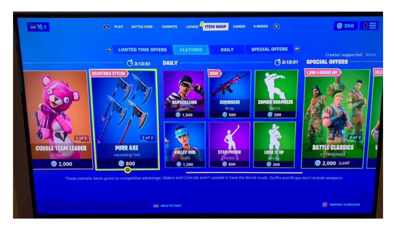
Figure 1. The shop in Fortnite displays timers for each category of purchasable item.